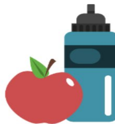
Good Nutrition and Diet